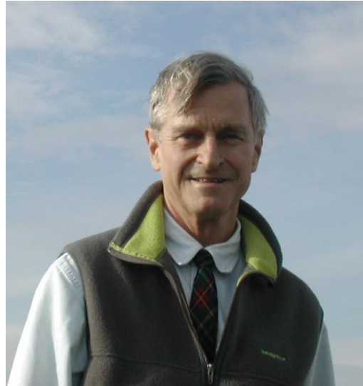
Bascom-Plaenert Professor of Liberal Arts Professor Emeritus, Atmos. & Oceanic Sci. University of Wisconsin, Madison Member, National Academy of Sciences

When did the Anthropocene begin? Observations and climate model simulations