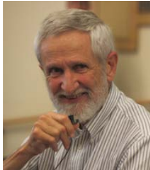
Professor of Atmospheric Sciences University of Washington, Seattle Member, National Academy of Sciences

28 March (Thursday), 2013 Lecture: 6:00pm; Reception: 5:00pm Auditorium (Rm 2400), CSS Bldg.